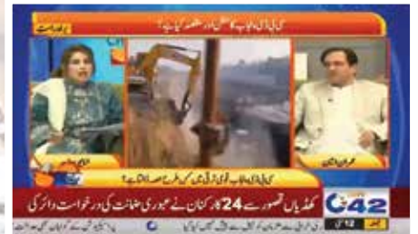
CEO CBD Punjab Mr. Imran Amin Interview on City @ 10